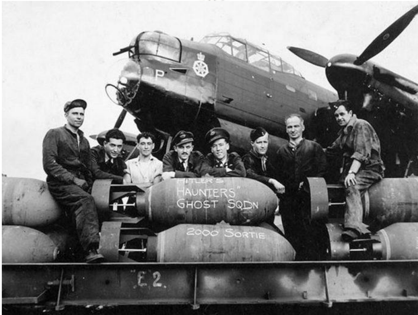
Pictured are the aircrew and groundcrew of No. 428 Squadron (also known as the "Ghost Squadron", one of the No. 6 Group RCAF squadrons) with their Avro Lancaster, which flew the squadron's 2000th sortie, a raid on Bremen in Germany.